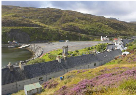
Proposed site, Tarbert, Isle of Harris